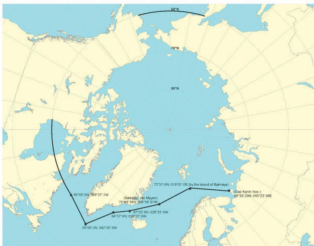
Figure 2 – Maximum extent of Arctic waters application 3